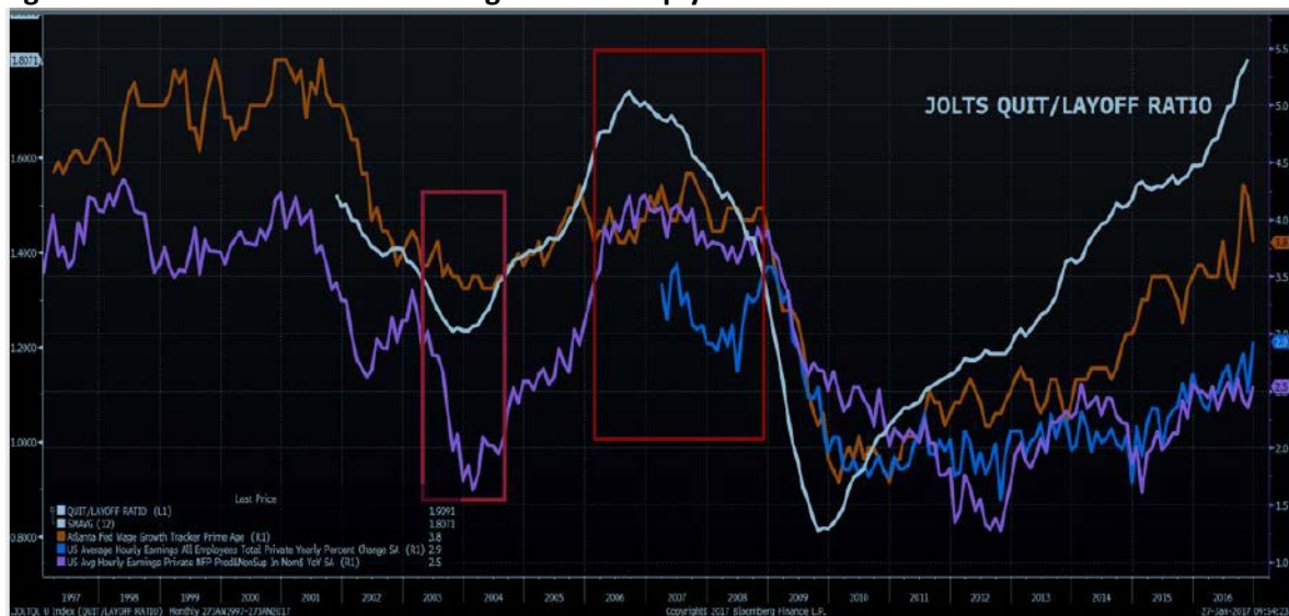
Figure 4: Labor Market Conditions Tightened Sharply in 2016

Plenty of other data confirm that labor market conditions already are tight even without any added pressure from Trump's proposed immigration restrictions and infrastructure buildup. In Figure 4 below, I show an inferred measure of labor market strength from the BLS' JOLTS data – the number of workers who quit their jobs to those who are involuntarily laid off, shown as the white line - along with the same wage data as in Figure 3. When jobs are plentiful, workers are much more likely to aspire to a better one and to take action especially if a new job offers more pay. Conversely, layoffs rise dramatically in recessions and fall as qualified workers become more difficult to recruit. Thus, this ratio is a good tracker of business cycles and even represents a decent lead indicator of both downturns and recoveries. It also is correlated, albeit with a much longer lag, with wage pressures. When face with the prospect of losing sales for lack of enough workers, employers usually will take the only other effective option – they raise pay. These JOLTS data, which moved sharply higher in 2016 and have reached record levels, indicate that US employers now face that predicament.