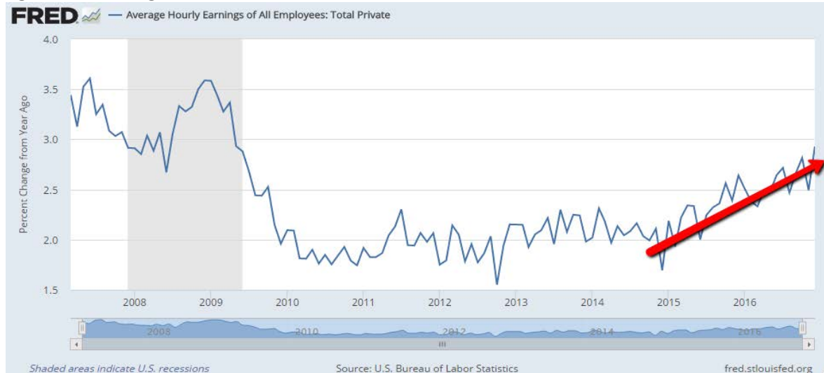
Figure 2 – US Wages Are on the Rise

composition of the job market and the workforce. Most notably, older workers with more experience are paid more than younger workers even in the same jobs, and those higher paid now have been retiring in droves over the past decade, which depresses the average wage as measured by this survey. The Atlanta Fed attempts to adjust for this demographic distortion by constructing a wage series for prime age workers, shown as the white line in Figure 3. For that group wages have increased 4.3% over the past year and show a risen trend since 2014 consistent with businesses common complaint that they cannot find enough workers with the requisite skills.