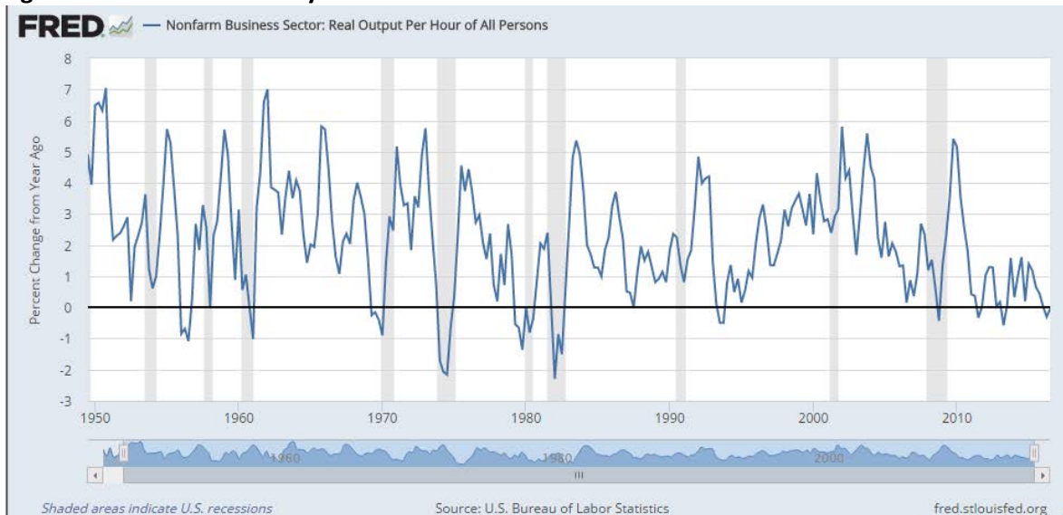
Figure 5: Dismal Productivity Growth

While rising real wages are desirable on many counts, this trend comes at an inopportune time when businesses are doing a poor job of improving productivity, which is the lifeblood for profitability and future gains in real wages. Trend productivity growth has trended lower since the turn of the century and has averaged less than 1% per annum this decade. That is a very small offset to real wage gains, reminiscent of the 1970s and 1980s, when excess demand morphed into cost-push pressures as the dominant theme for inflation. We are not near that tipping point yet, and I doubt the Fed is willing to revisit that ugly era. However, these macro data suggest what happens when an economy pushes too hard at full employment – growth alone does not lift aggregate productivity but it can drive equity valuations to new heights.